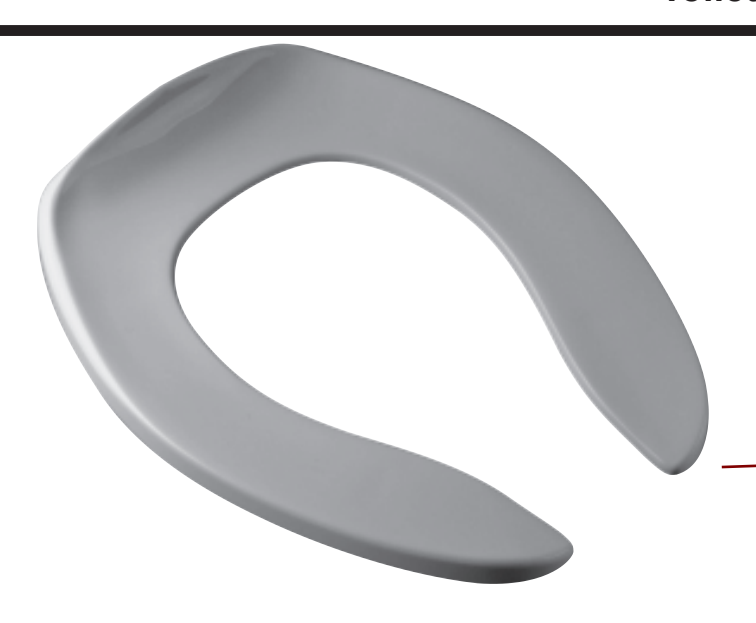
Z5955SS-EL shown above