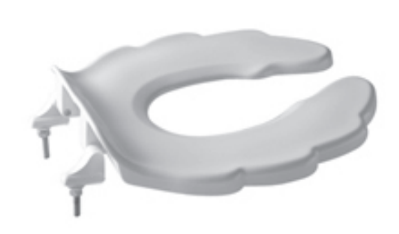
Z5955SS-JUV shown above