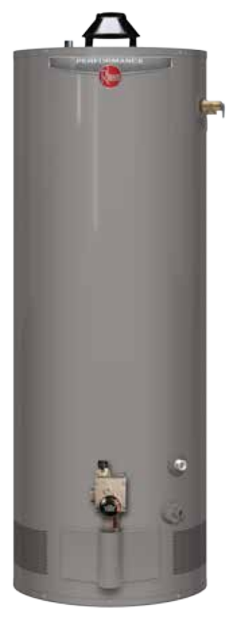
PERFORMANCE Atmospheric for Manufactured Housing

Units meet or exceed ANSI requirements and have been tested according to D.O.E. procedures. Units meet or exceed the energy efficiency requirements of NAECA, ASHRAE standard 90, ICC Code and all state energy efficiency performance criteria.