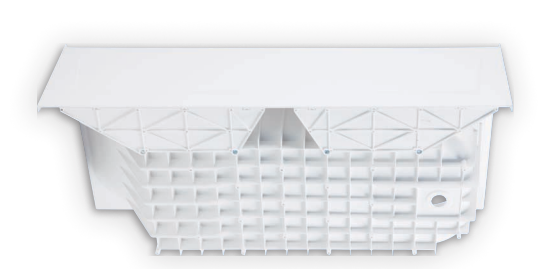
Extra-strong ribbed bottom and sides for unmatched strength & stability.