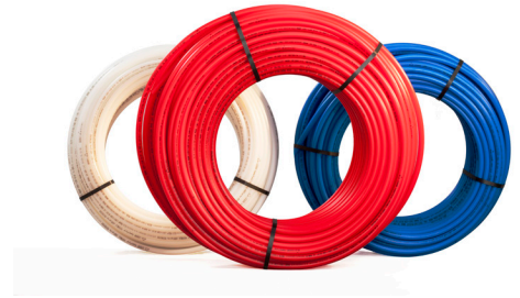
Pictured: HyperPure® Coils