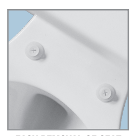
EASY REMOVAL OF SEAT FOR THOROUGH CLEANING