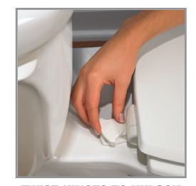
TWIST HINGES TO UNLOCK